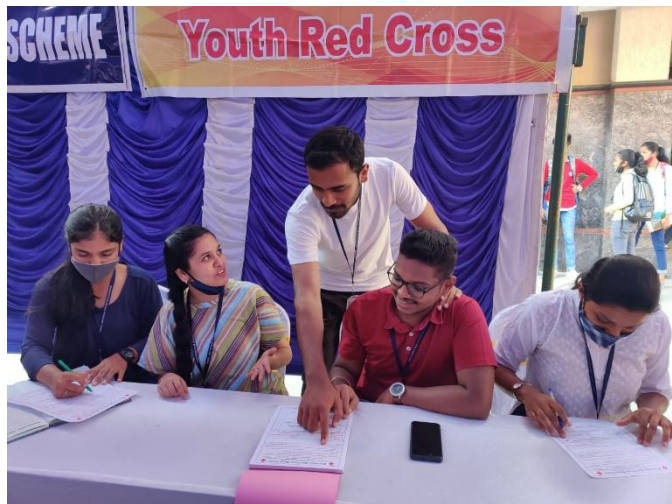
The Students' Council Members were part of registration process during Voluntary blood donation camp on 26/02/2022.