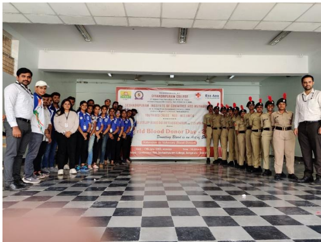
World Blood donor Day was organized in the College on 13/06/2022.

The elected students of the Student Council have been very active during the academic year in organizing, participating in various activities of the institution. Glimpses of the student council participation.