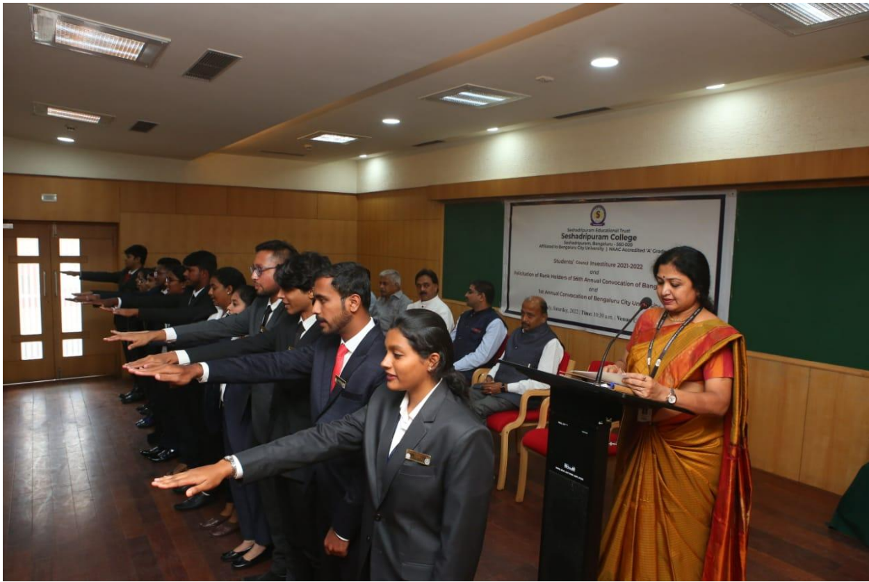
Elected body of Students' Council taking oath during Students' Council Investiture 2021-22.