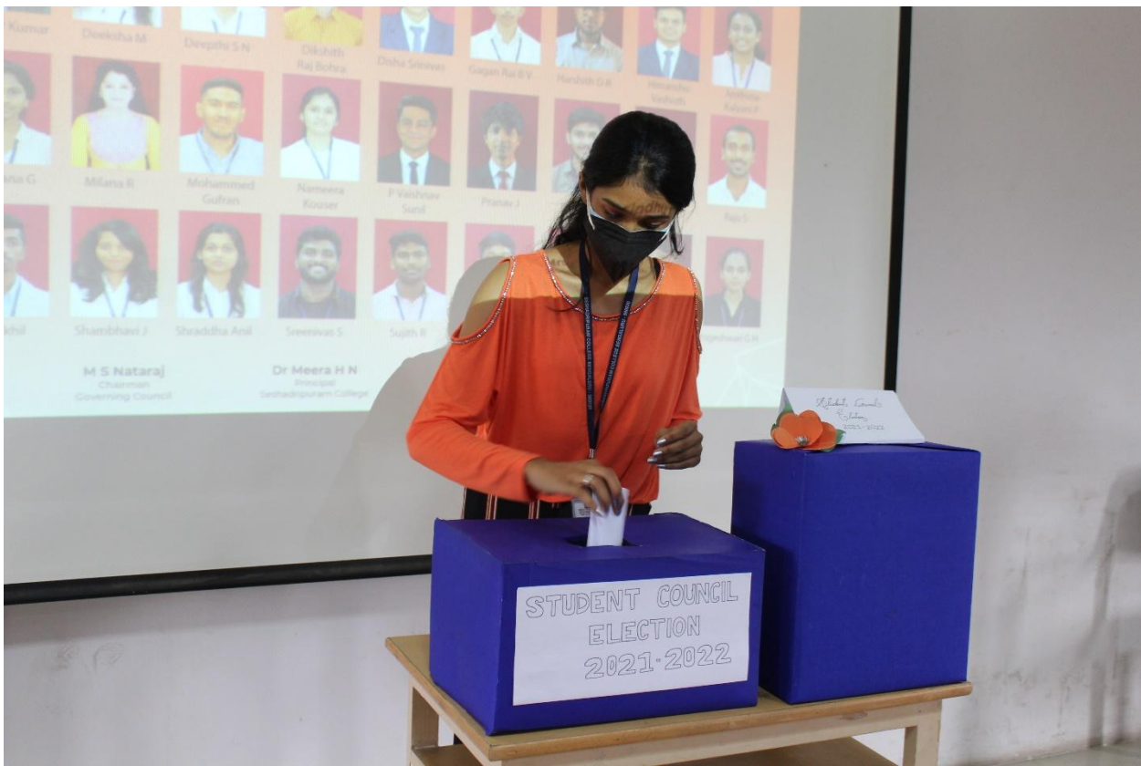
In the above picture a student is voting on the polling day