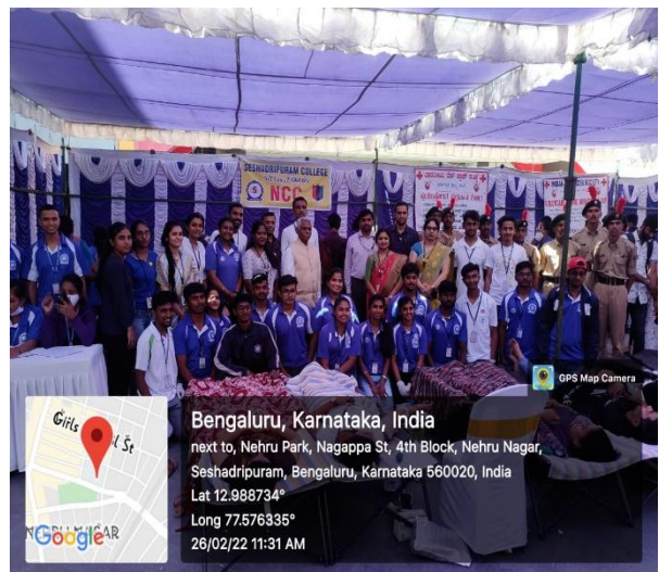
Students' Council members during the Blood Donation Camp held on 26/02/2022