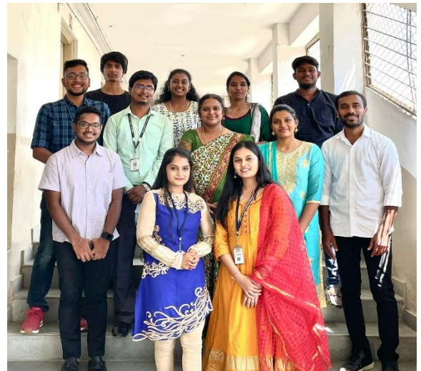
Students' council member volunteered for a program on 'Perception of Women empowerment through gender equality for the holistic development' held on 09/03/2022